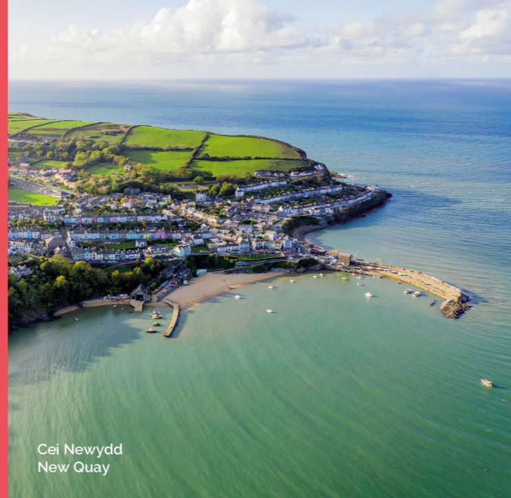
Cei Newydd New Quay